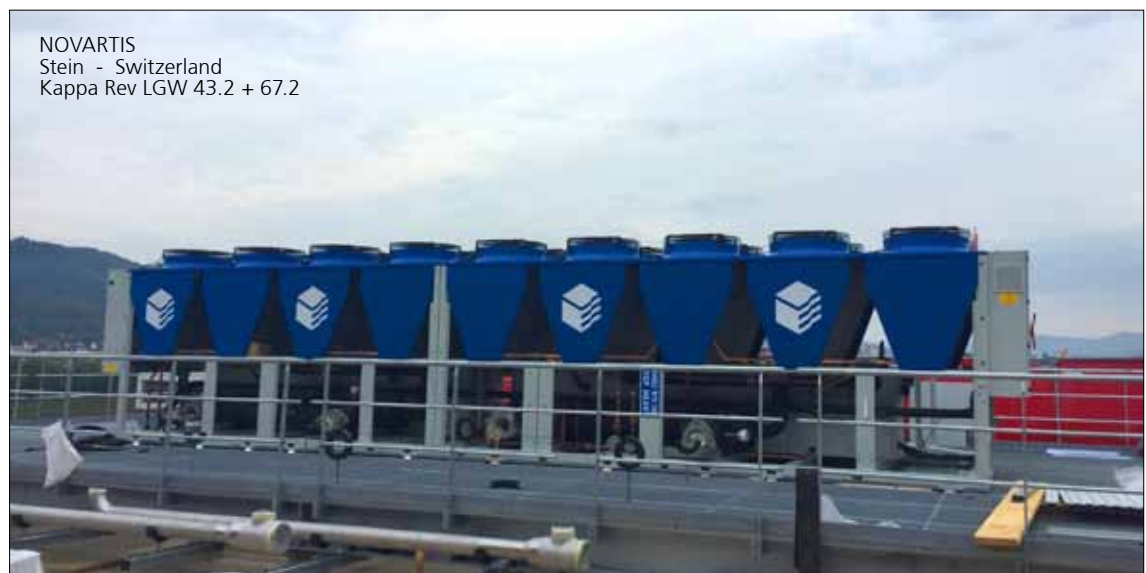
NOVARTIS Stein - Switzerland Kappa Rev LGW 43.2 + 67.2