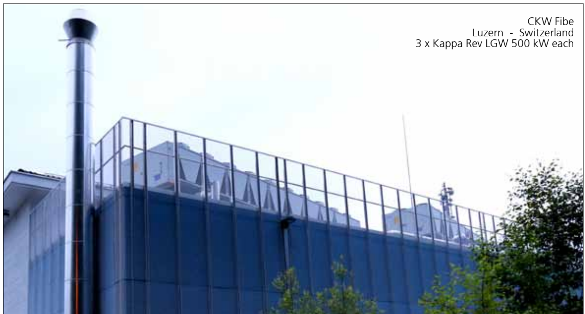
CKW Fibe Luzern - Switzerland 3 x Kappa Rev LGW 500 kW each