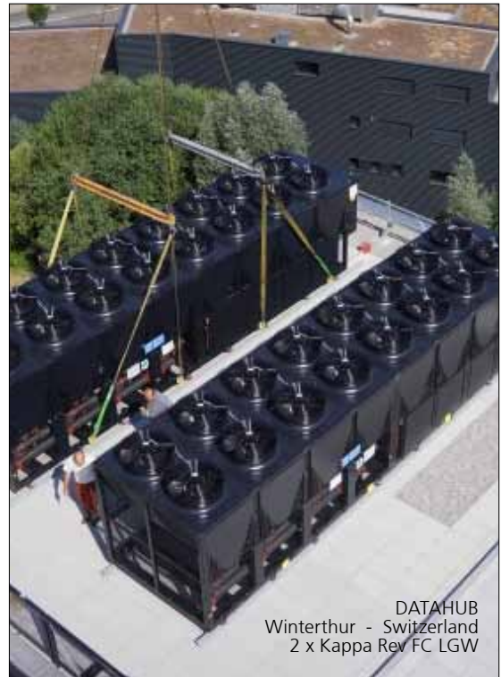
DATAHUB Winterthur - Switzerland 2 x Kappa Rev FC LGW

KAPPA REV LGW models are also listed in the Eurovent certification programme