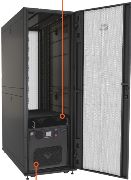
Battery Module (3U)

Flexible, easily installed in pre-configured customized server racks which saves footprint & cost too.